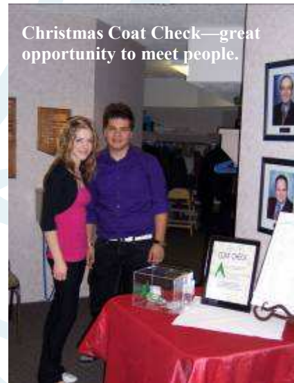
Christmas Coat Check—great opportunity to meet people.

Youth volunteers bring a fresh and energetic perspective to organizations and programs. Young people turn to community service as a way to learn work skills, gain experience for future employment opportunities improve their abilities. The Christmas Bureau provides various volunteer opportunities for young adults (16 to 25) to learn valuable skills while providing hope and dignity at Christmas time to families, seniors and individuals in need.