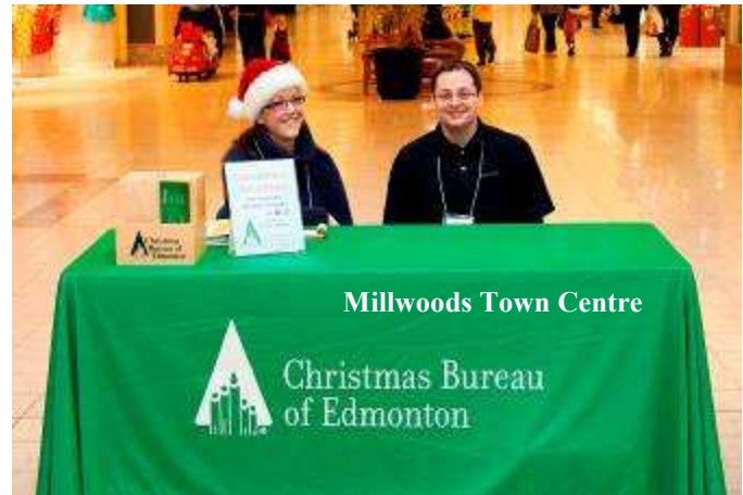
Millwoods Town Centre

If you are a social person who enjoys meeting and talking with new people, the Donation Desk Ambassador is an ideal volunteer opportunity for you and a friend.