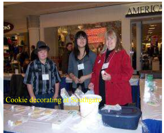
Cookie decorating at Southgate