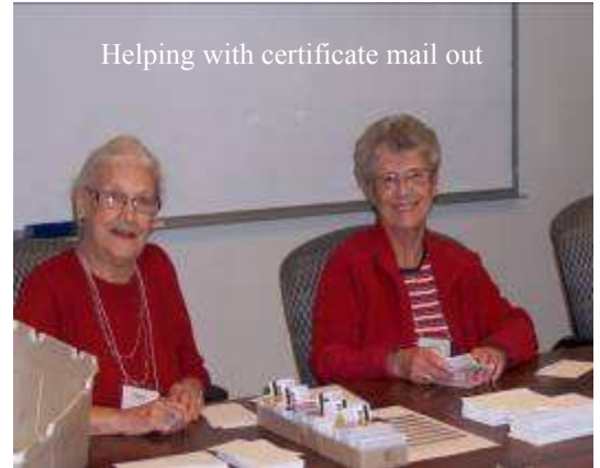
Helping with certificate mail out

Your gift of time and compassion to our community is priceless. I am honoured to be a volunteer with you in this year's campaign. Thank you for continuing to promote the spirit of Christmas caring and sharing in the City of Edmonton.