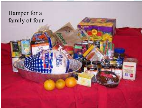
Hamper for a family of four

Private Hamper Sponsorship: A great way for a group to get involved. You purchase the food items and deliver the hamper to a Christmas Bureau family in need. This is a very gratifying experience for all! For details on the private hamper sponsorship program, visit christmasbureau.ca/sponsorship or call Ann at 780 414 7686 (note: the Private Sponsorship program opens November 15.)