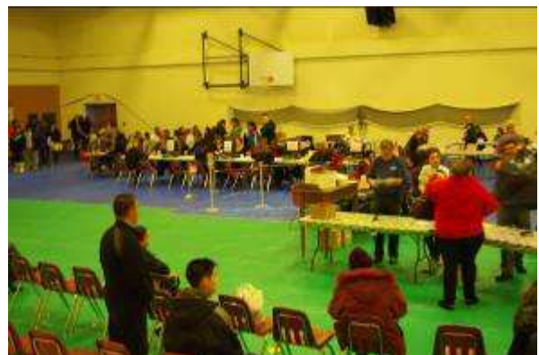
Walk-In Days at Amiskawiczy Academy Gymnasium

If you have a second language, this is an added bonus as interpreters are always in demand at Walk-In Days.