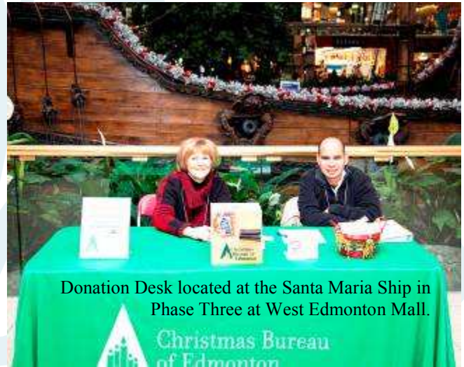
Donation Desk located at the Santa Maria Ship in Phase Three at West Edmonton Mall.